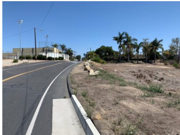
HCHR Oceanside Before Sidewalks