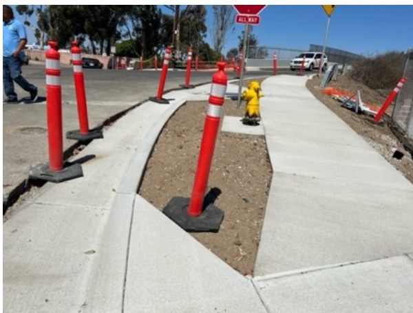
HCHR Oceanside After Sidewalks

The Crown Heights Community Enhancements and Improvements project was submitted for funding to the Clean California Grant Program in January 2022. The project was the result of community input received through the HOC as suggestions culminated in a comprehensive package of projects to beautify the neighborhood, while also improving safety and comfort for those walking to destinations throughout and bordering the